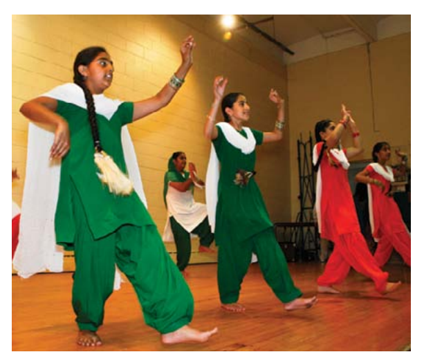
Goal 5: Create an environment where arts, culture and heritage flourish, enhance civic pride, and function as an economic driver for the community

A vibrant cultural sector contributes to making Brantford a great place to live, work, play and raise a family. Over the past decade, recognition of the important role played by the cultural sector in supporting strong local economies has grown dramatically. In 2012, approximately 13.5% of jobs in Brantford were in the core "creative class" occupations (See Appendix C). Continued and enhanced support for cultural sector businesses and entrepreneurs is important for ensuring that Brantford continues to have a diverse and prosperous economy by providing jobs, driving tourism, and increasing the sustainability of the cultural sector.