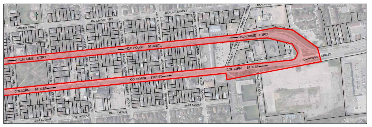
Map 3 - Close up of Study Area, Part 2

This notice first issued on July 16, 2020.