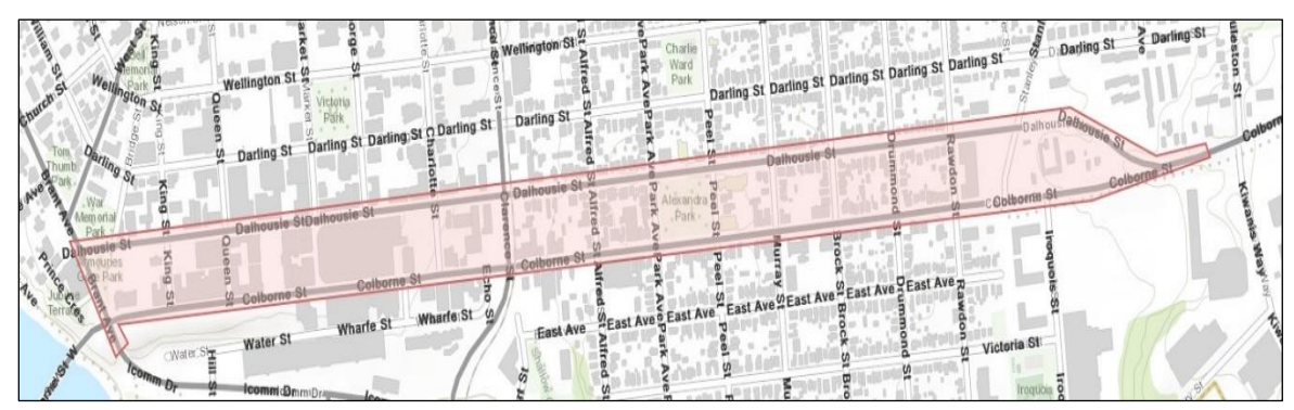
Map 1 - Full Study Area