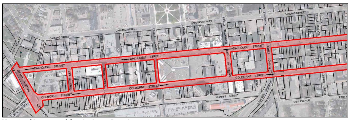
Map 2 - Close up of Study Area, Part 1