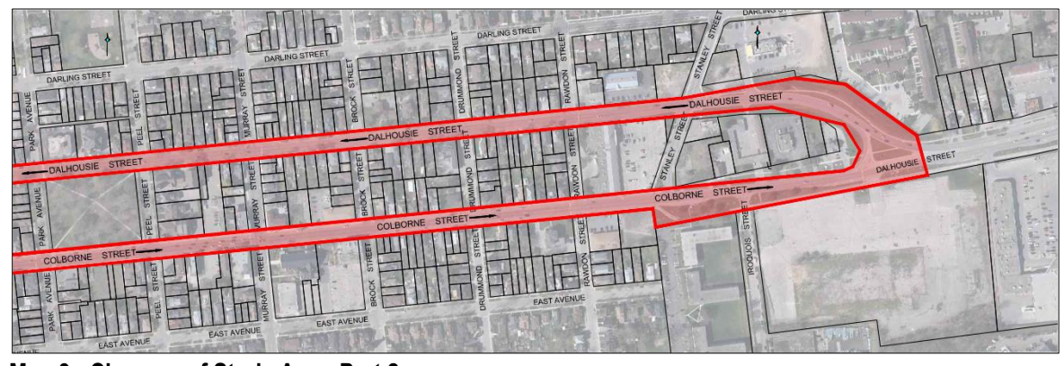
Map 3 - Close up of Study Area, Part 2

This notice first issued on November 19, 2020.