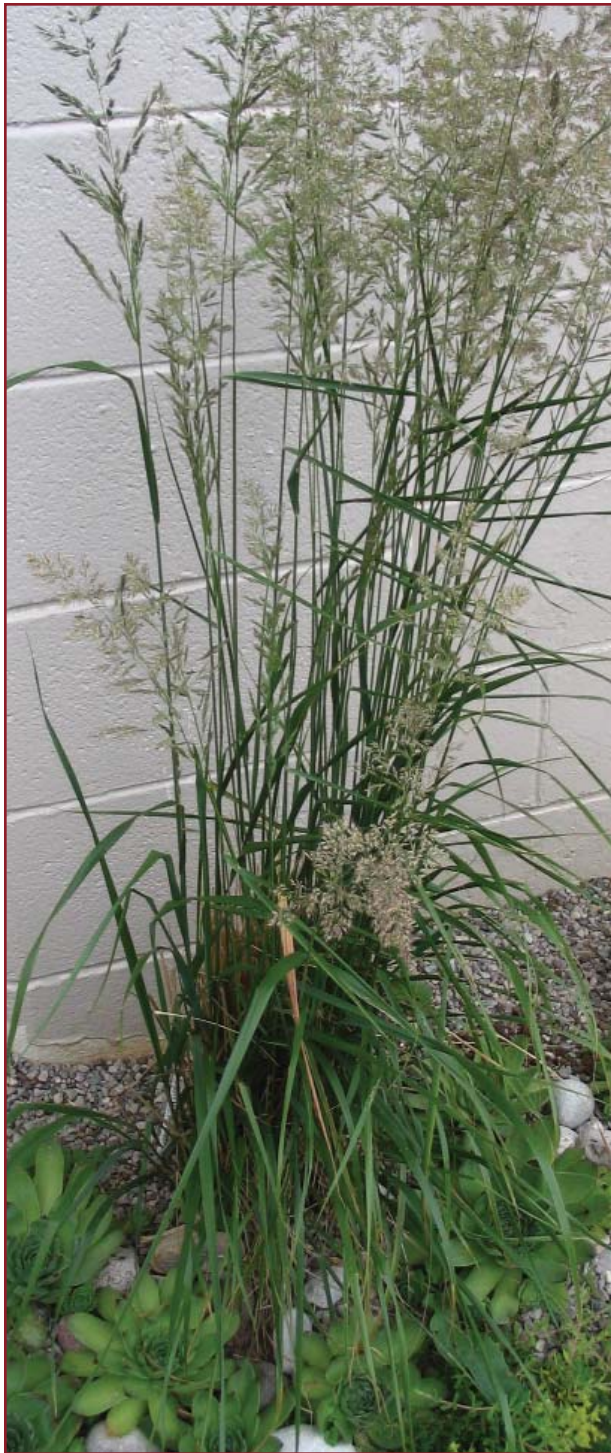
Feather Reed Grass, Hens and Chicks

WATERWISE GARDEN: Tranquility Hall (corner of Powerline Rd. & Francis St.)