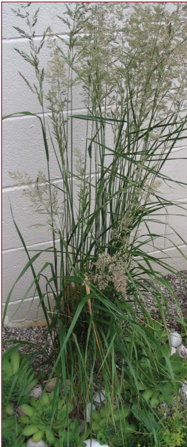
Feather Reed Grass, Hens and Chicks

WATERWISE GARDEN: Tranquility Hall (corner of Powerline Rd. & Francis St.)