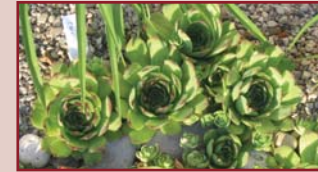
Hens and Chicks

Buglewood - Ajuga reptans English Ivy (vine) - Hedera helix "Baltica" Clematis sp. (vine) Climbing Hydrangea (vine) - Hydrangea anomala petiolaris Periwinkle - Vinca minor