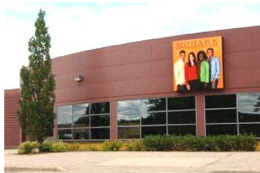
Mohawk's Brantford Campus on Elgin Street