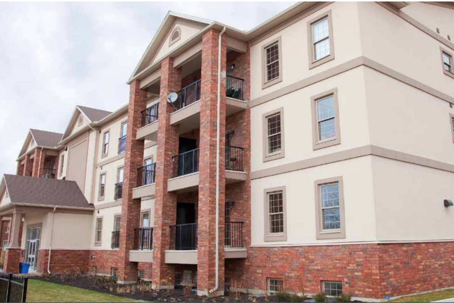
The new development on Alfred Street opened in 2011 with a total of 34 units.