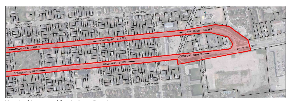
Map 2 - Close up of Study Area, Part 2