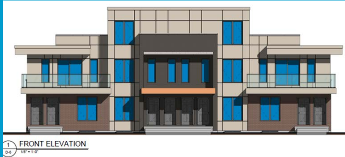
Units fronting Dunsdon and Brantwood Park