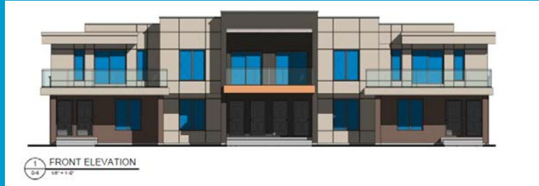
Units backing onto existing residential