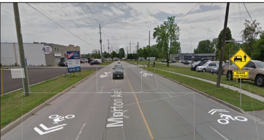
Image 2: Typical Road Design: Morton Avenue East and Holiday Drive