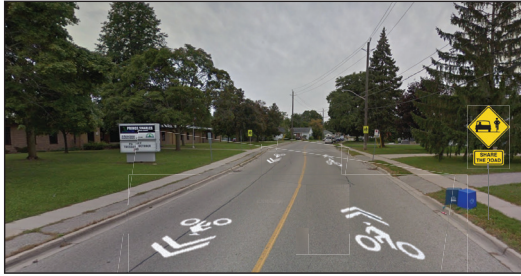
Image 1: Typical Road Design: Morton Avenue - North Park Street to West Street