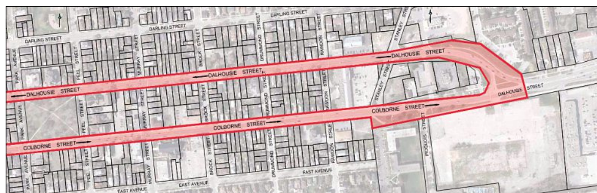
Map 3 – Close up of study area, part 2

This notice first issued on November 19, 2020.