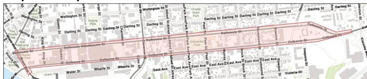
Map 1 – Full study area