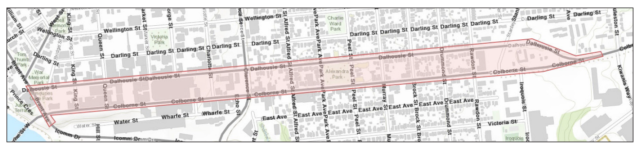
Map 1 – Full study area