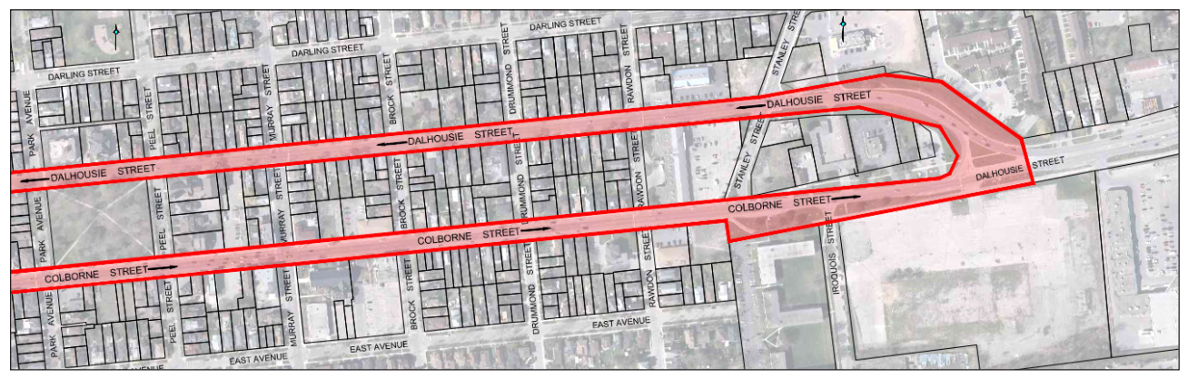
Map 3 – Close up of study area, part 2

This notice first issued on July 16, 2020.