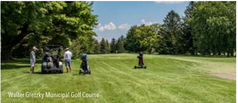
Walter Gretzky Municipal Golf Course

This mature 18-hole championship layout features large greens, contoured fairways, white bunker sand, a full pro shop and a clubhouse services, including a refreshment cart (weather permitting). Grab a delicious bite to eat at Wally's Grill & Patio following your round.