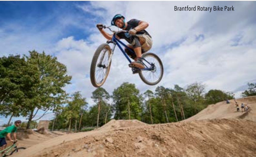
Brantford Rotary Bike Park

◀ Look for the Trail Mix signs between Hardy Rd. and River Rd. to enjoy free music by local artists. discoverbrantford.ca/TrailMix