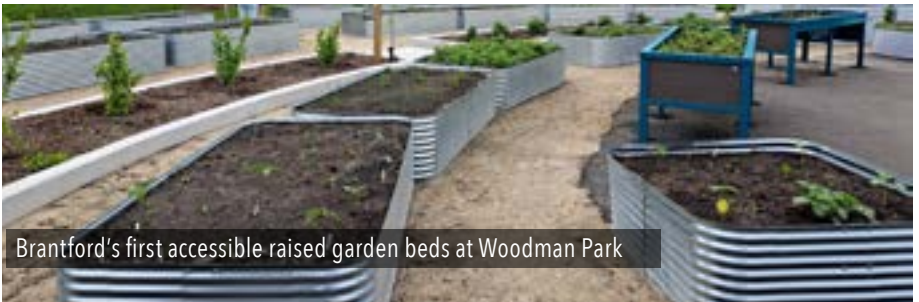
Brantford's first accessible raised garden beds at Woodman Park

The world's climate is changing and the effects can be seen everywhere, even locally. The City of Brantford is taking steps to reach net-zero emissions by 2050 and become a more climate resilient community. Some of the City's actions taken to date include developing a Net-Zero Building Standard for new municipal buildings, transitioning vehicles to be low or zero carbon, improving access to active transportation, providing resources to residents and businesses, and many others.