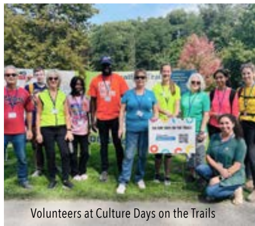
Volunteers at Culture Days on the Trails

Currently, 24 Neighbourhood Associations exist within the City representing the efforts of hundreds of community volunteers. These volunteers lead a variety of programs and initiatives such as the neighbourhood ice rink flood hero program, the snow buddies and leaf buddies programs, sports and recreational programming, beautification and park stewardship programming, social inclusion programming, and a wide range of community events and fundraisers.