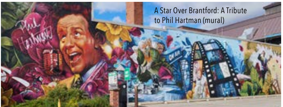
A Star Over Brantford: A Tribute to Phil Hartman (mural)

In 2024, Tourism staff added three new murals to the City's Public Art Collection. These murals contribute significantly to the beautification and revitalization of Brantford's downtown, while also reminding visitors and residents of our history and achievements.