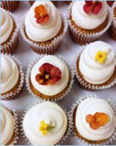
Lemon Lavender Cupcakes from SWEET Bakery