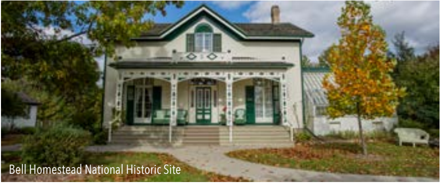
Bell Homestead National Historic Site

The City of Brantford and numerous non-profit community groups work together to preserve Brantford's rich history and tell the collective stories of our community. The Brantford Heritage Committee acts as a municipal heritage committee and maintains a comprehensive Heritage Register in accordance with the requirements of the Ontario Heritage Act. The Heritage Register includes all the City's designated heritage properties (over 200), as well as more than 500 'listed' properties that are not designated but have unique heritage value.