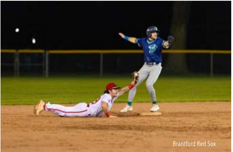
Brantford Red Sox

Brantford's primary sports and leisure facility for over 55 years, offering 65m and 25m pools with a 150' waterslide, four NHL sized rinks, fitness rooms, fully equipped weight room, indoor track and much more.