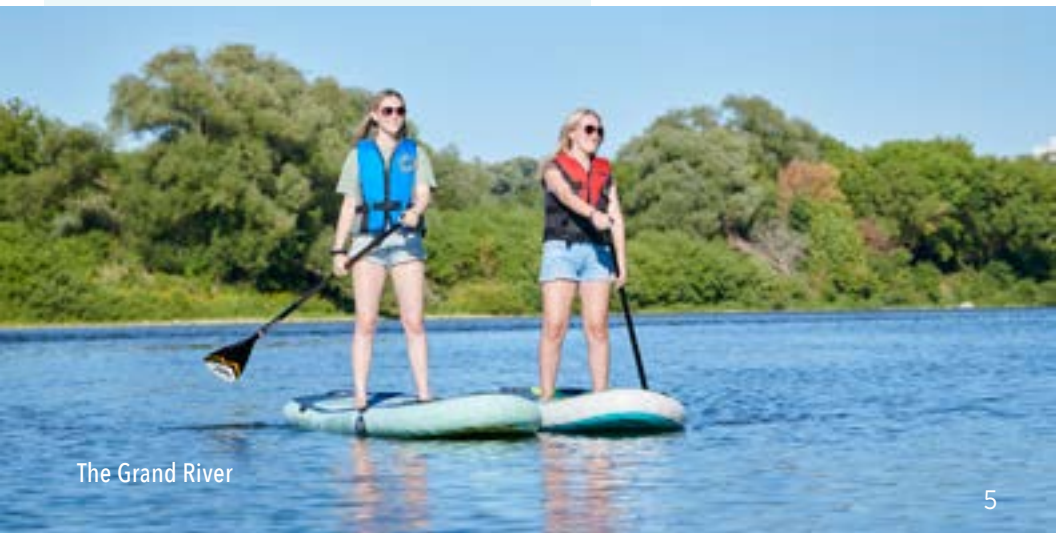
The Grand River